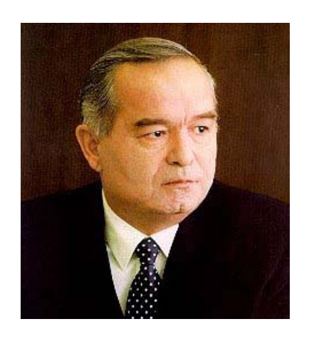
Islam Karimov President of the Republic of Uzbekistan

The elections to the first bicameral Parliament, without any exaggeration, took a special, remarkable place in the modern history of Uzbekistan. The elections, held completely in line with the Constitution, electoral legislation of the country and international norms and regulations, in transparent and tolerant environment, vividly manifested a successful advancement of Uzbekistan on the way of building democracy and a civic society. Summarizing results of the elections in Uzbekistan, it is worth to underscore the following: